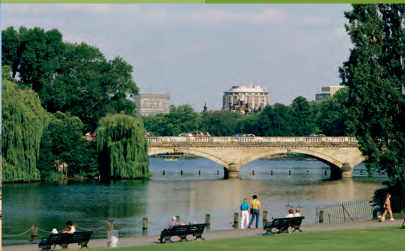
Along the banks of the River Thames.

The River Thames runs through the city and a lot of bridges 1 cross it. You can take a lovely boat ride on the River Thames and ride under Tower Bridge.