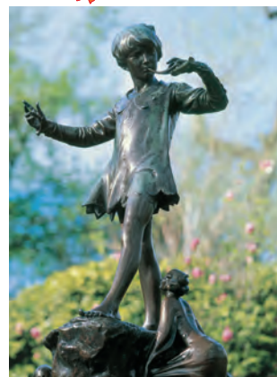
The statue of Peter Pan